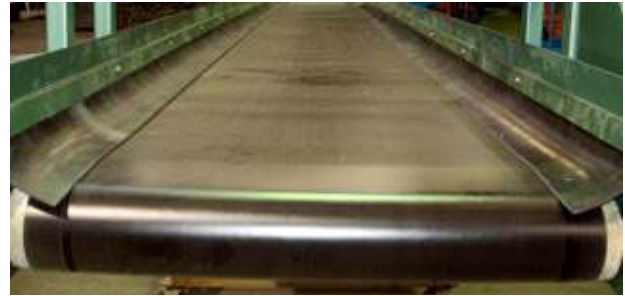
Conveyor skirting added to the frame of the conveyor helps prevent material from getting under the belt

take a few seconds, and you can greatly increase belt life.